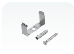
Fastening set (GESP+POE-IN)