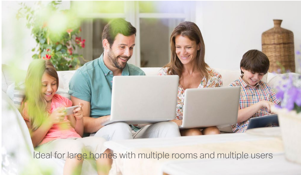
Ideal for large homes with multiple rooms and multiple users